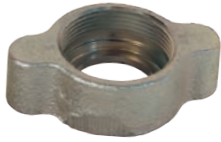
Plated iron / steel